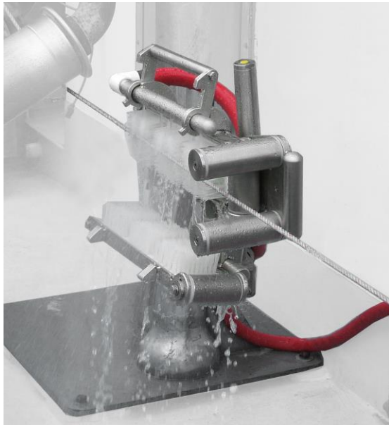
MODEL MFS03 Hydraulic-Operated Stainless Steel Fish Stripper/Hook Cleaner

J.K. Fabrication's improved Fish Stripper/Hook Cleaner has Features found no where else.